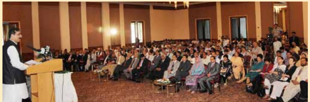
Prime Minister Syed Yusuf Raza Gilani delivering his inaugural speech at International Conference on “Kashmir in Emerging Global Perspectives”

Gilani favoured for continuing the dialogue between Pakistan and India for the resolution of Kashmir issue.