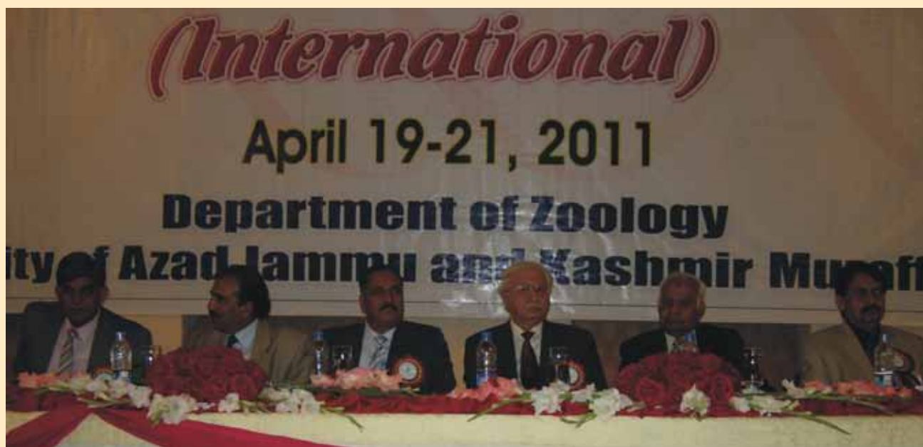
President AJ&K Raja Zulqarnain Khan and others during 31st Pakistan Zoological Congress (International)