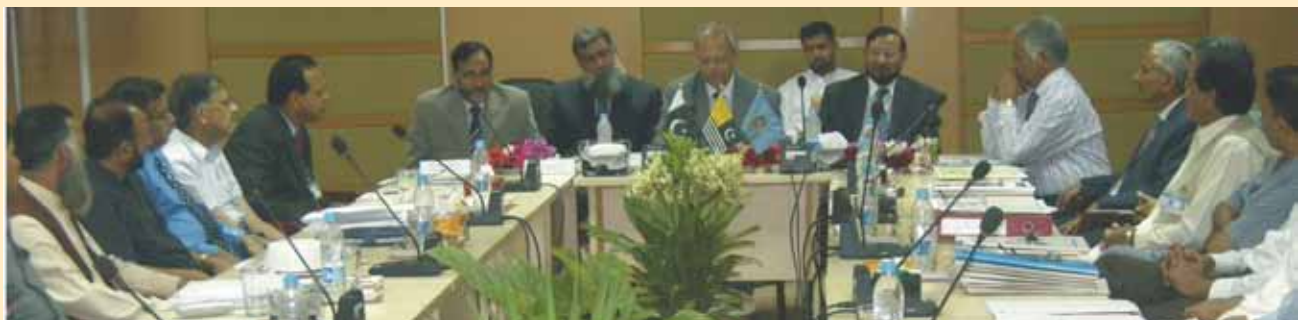
A view of the PhD review committee's meeting at UAJK