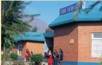
Main Campus Muzaffarabad