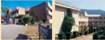
Kotli Campus Rawalakot Campus