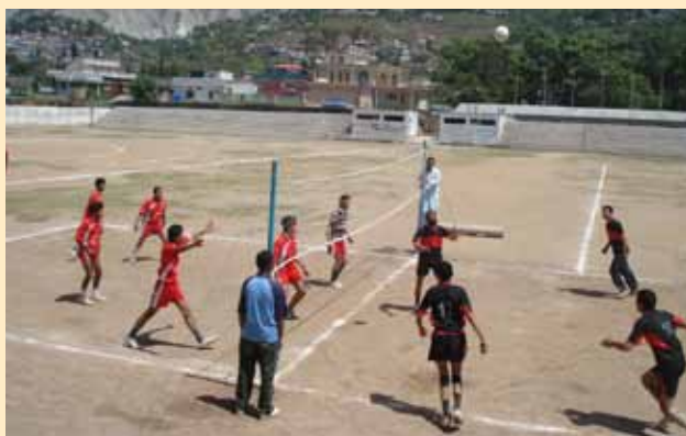
A view of the Volleyball match at AJK Varsity