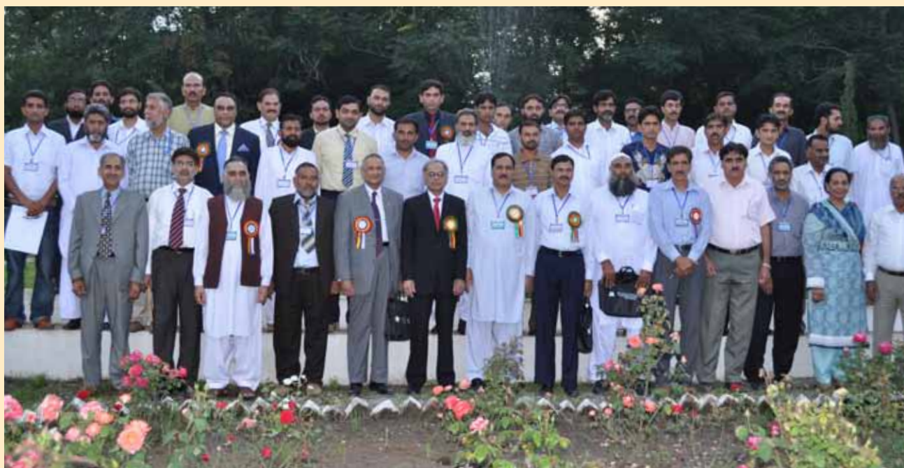
A group photo of participants of International Science Conference on “Prospects and Challenges to Sustainable Agriculture”

They stressed Entomologists and Plant pathologists for strategic planning rather than crises management for upcoming diseases and pests. Biotechnology sector was also emphasized to solve specific problems faced by agriculture community and to avoid repetition in order to